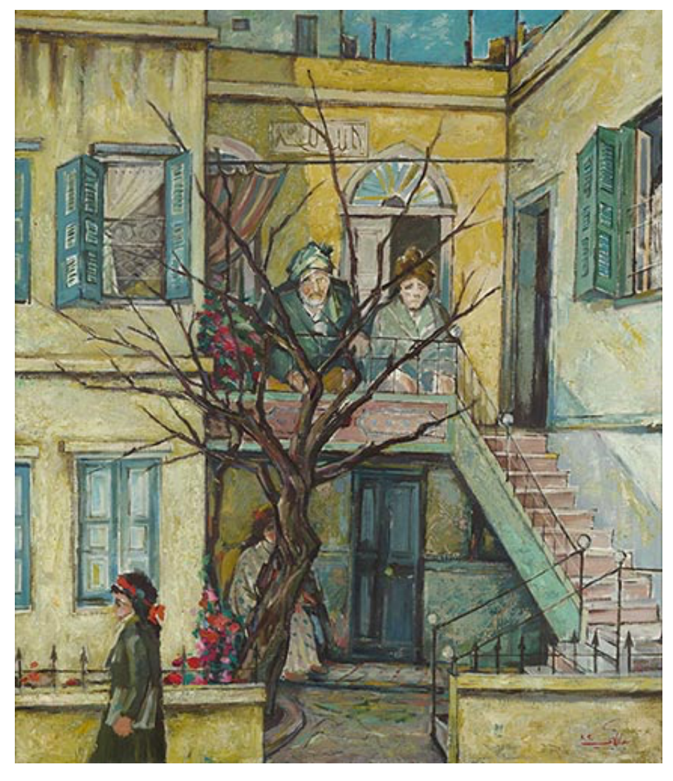
Mash'Allah - Oil painting, 102 x 89 cm