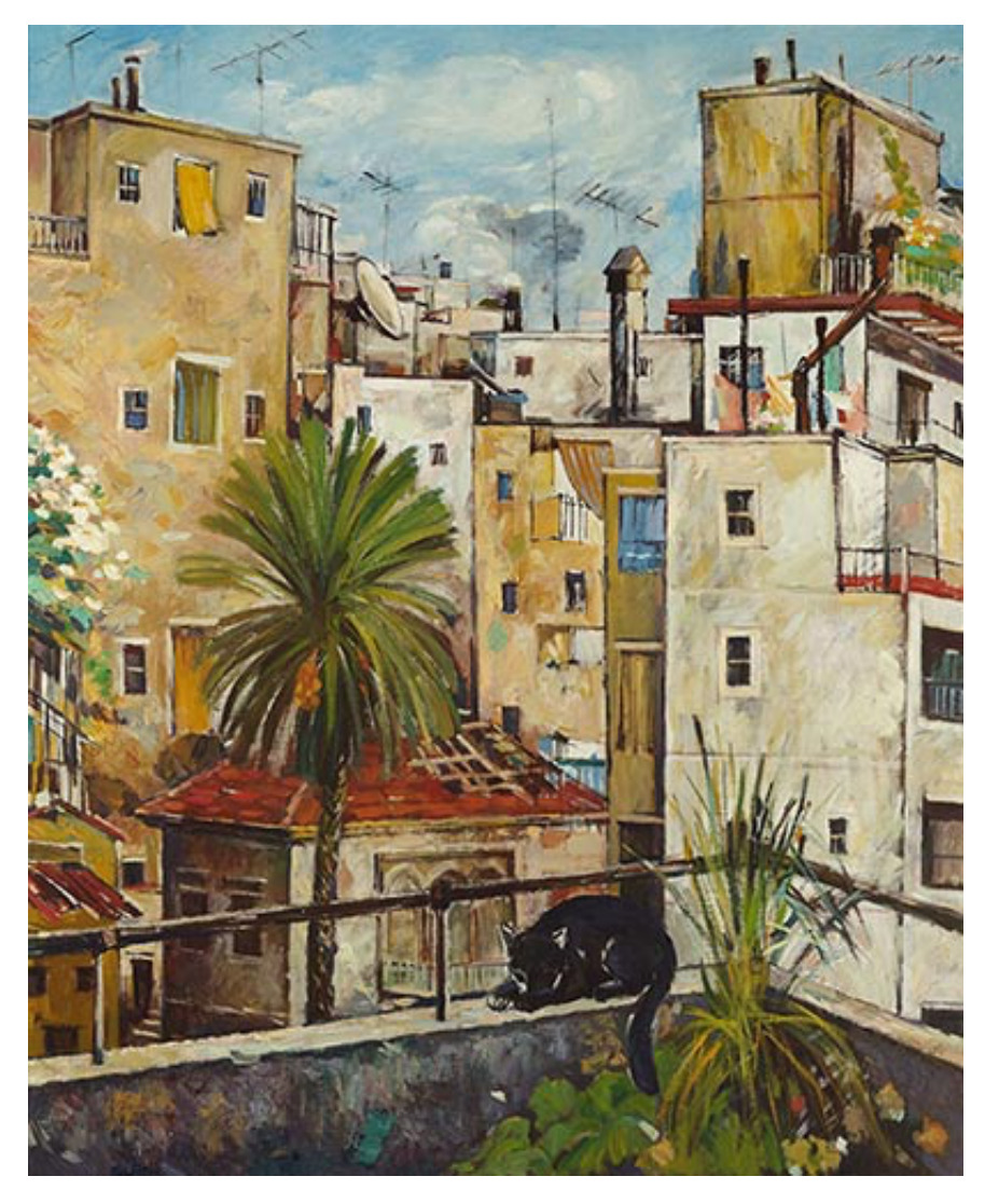
Hamra - Oil painting 110 x 90 cm